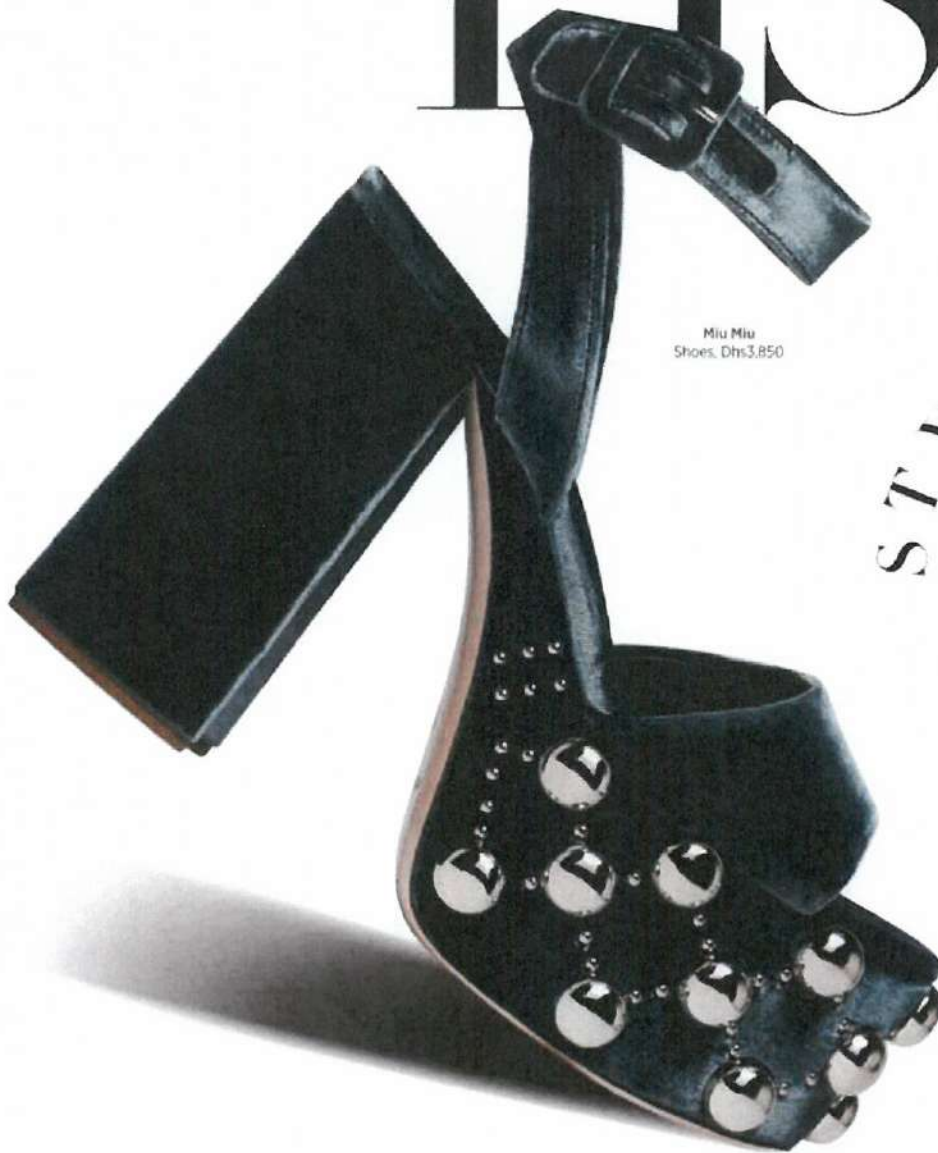
Miu Miu Shoes, Dh$3,850