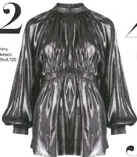
Elery at Ounass Top, Dh$4,720