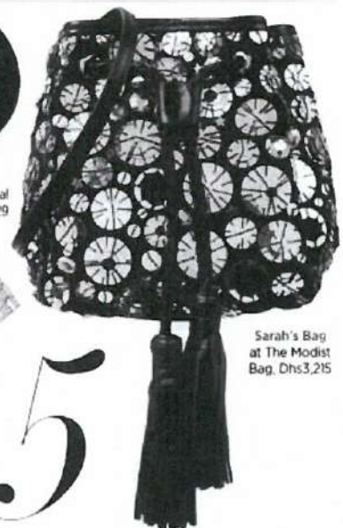
Sarah's Bag at The Modist Bag, Dh$3,215