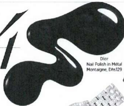
Dior Nail Polish in Métal Montaigne, Dh$129