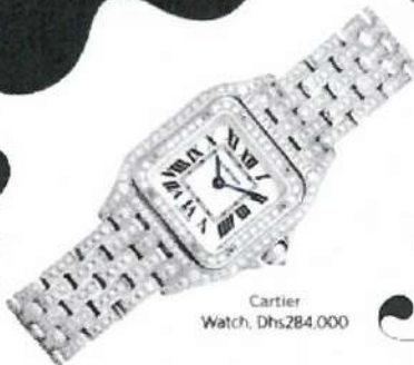
Cartier Watch, Dh$284,000