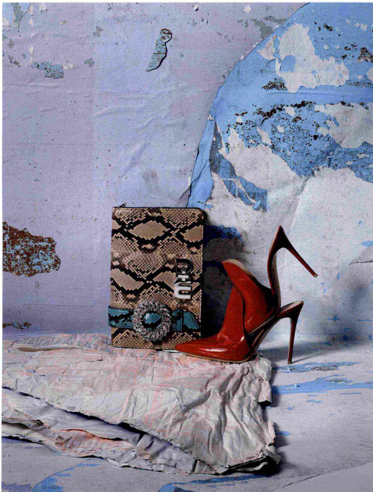
Pochette di pitone con tracolla di pelliccia staccabile, Miu Miu . Sabot di vernice con stiletto, Gianvito Rossi . Nella pagina accanto. Borsa a due manici in pelle con tasca di pelliccia, Valextra . Décolletée scultura in pelle e Pvc, Maison Margiela .