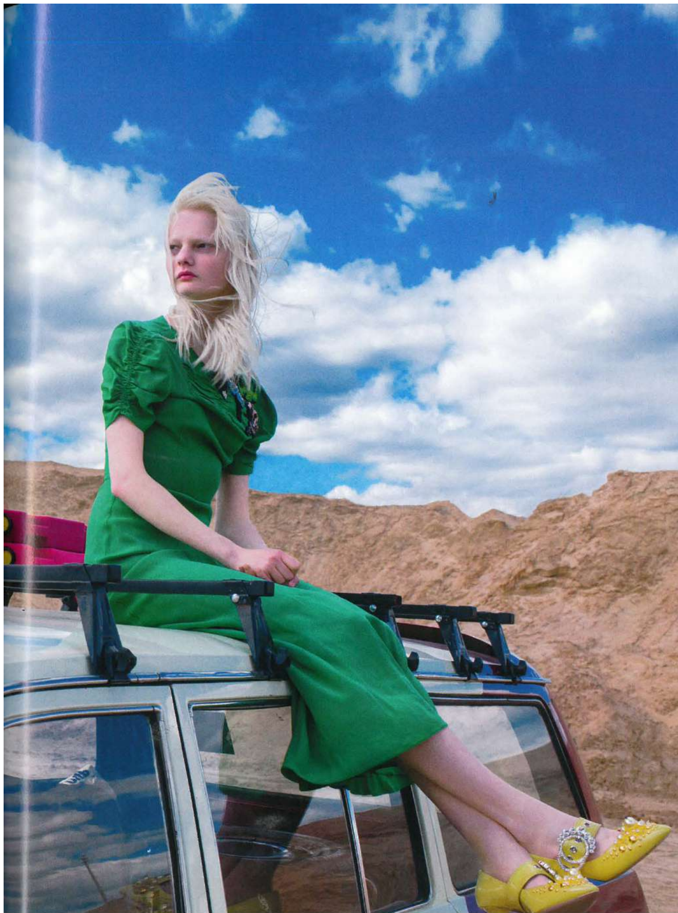
RUSSIA - SNC - MIU MIU - 13.07.2017