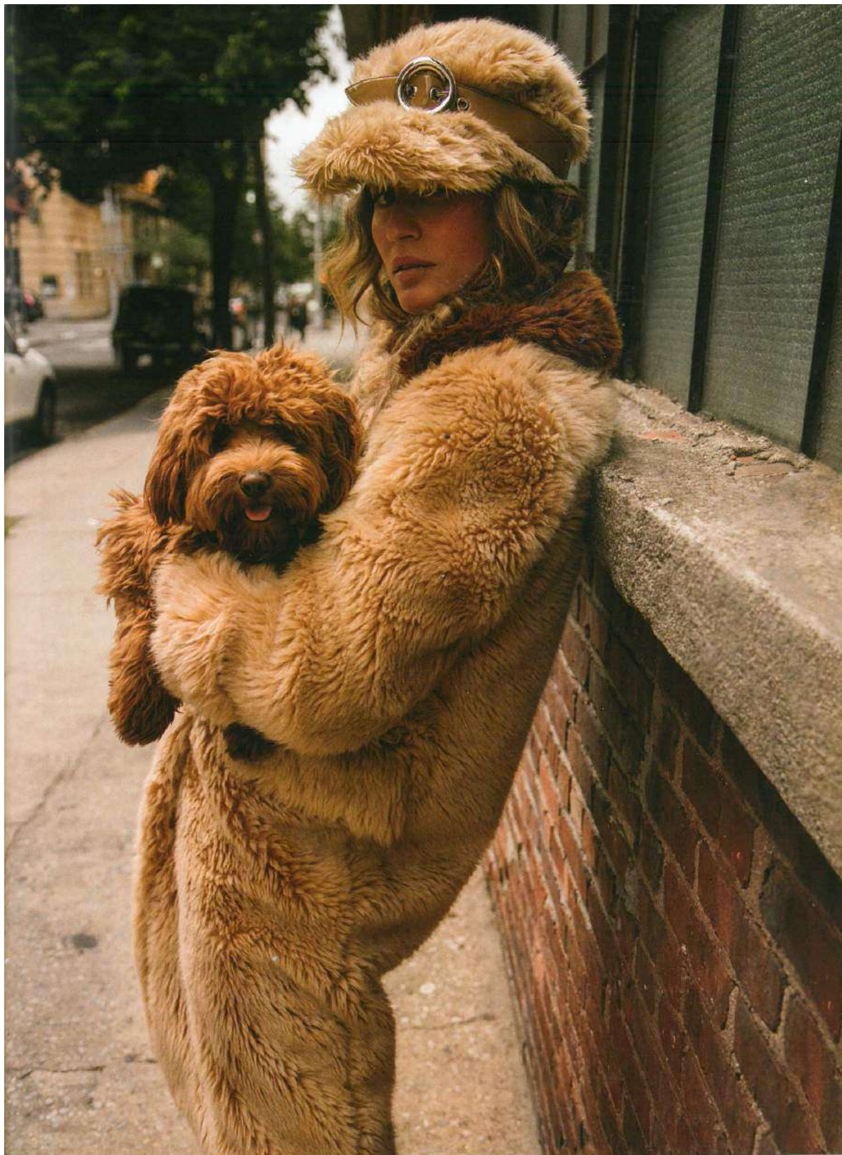
FRANCIA - VOGUE - AUGUST 2017