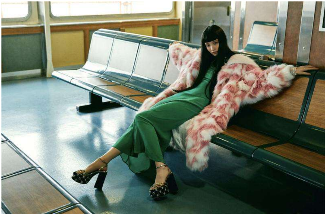
KAZAKHSTAN - HARPER'S BAZAAR - MIU MIU - 13.07.2017