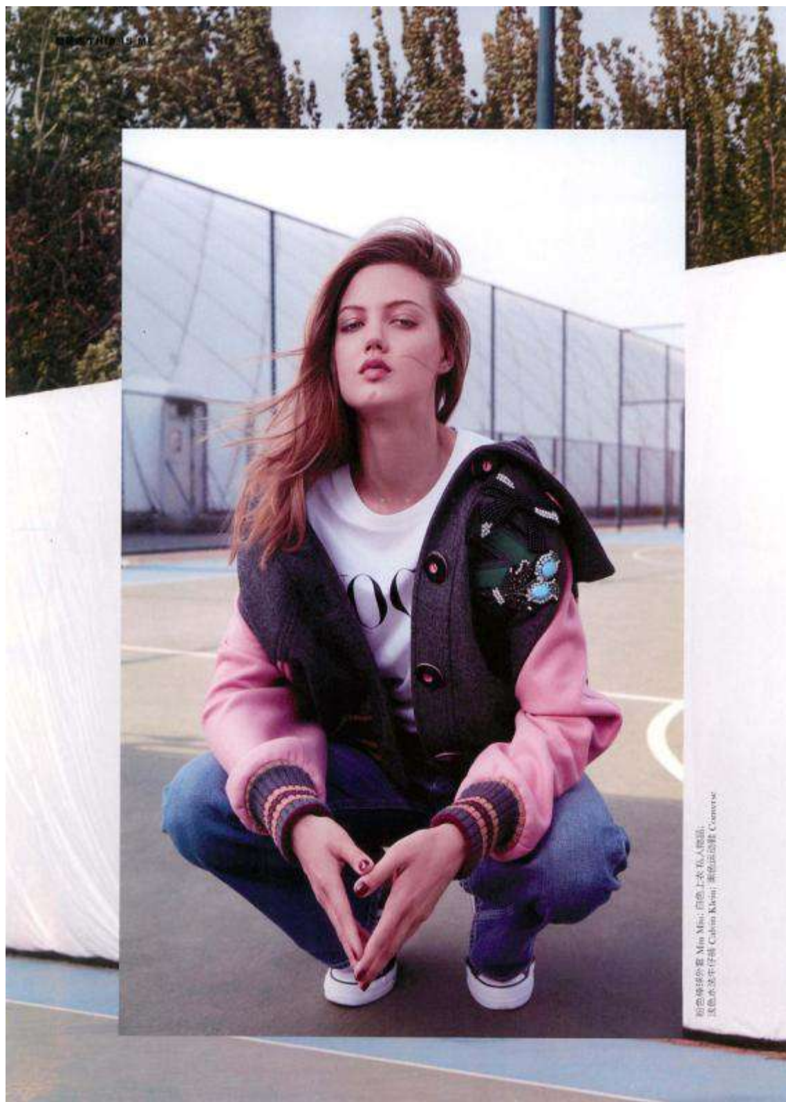
CHINA-VOGUE ME-MIU MIU-06.17