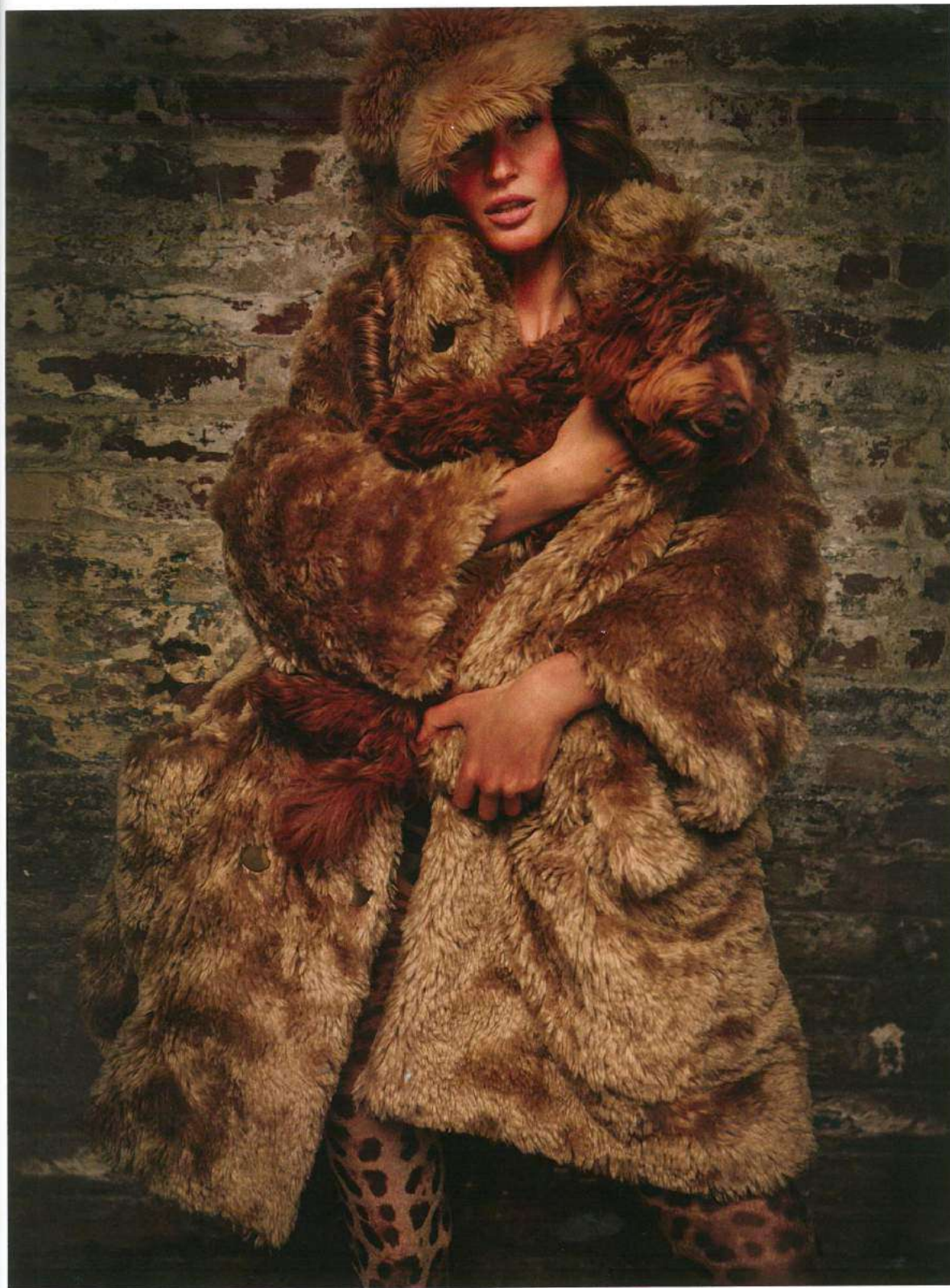
FRANCIA - VOGUE - AUGUST 2017