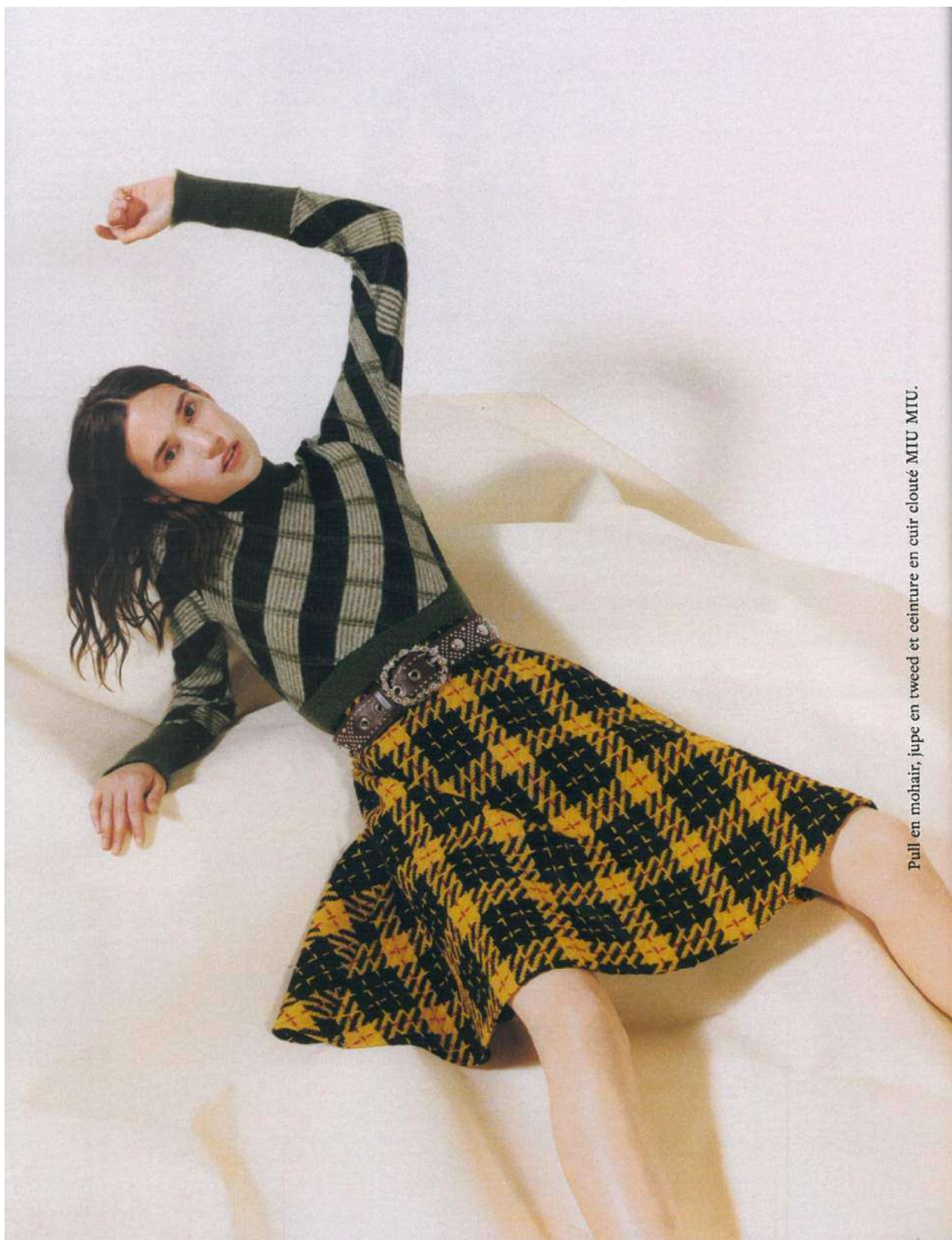
Pull en mohair, jupe en tweed et ceinture en cuir clouté MIU MIU.