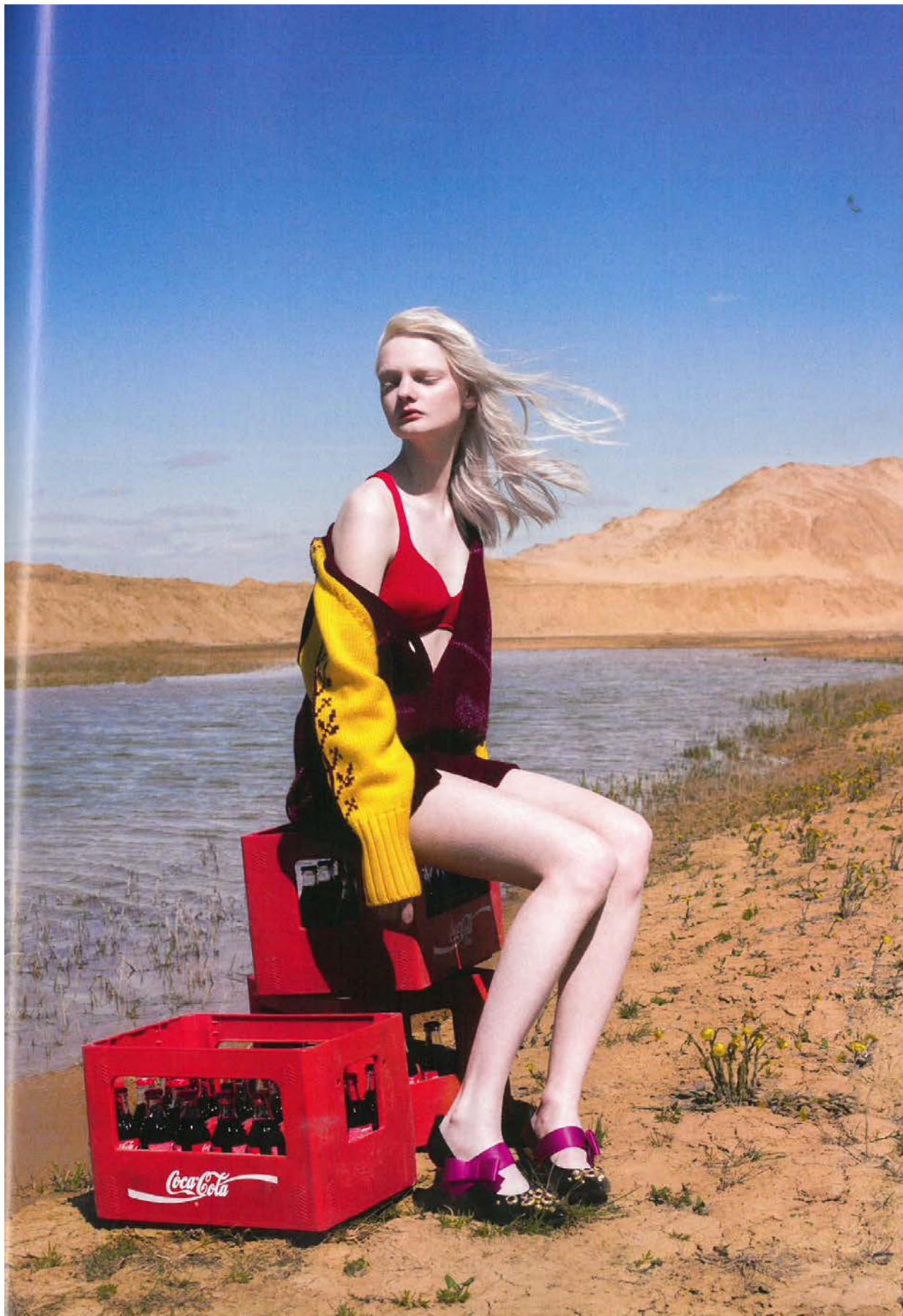
RUSSIA - SNC - MIU MIU - 13.07.2017