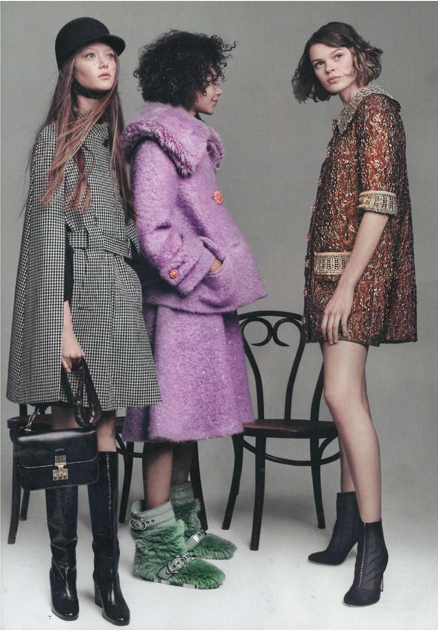
USA- VOGUE- MIU MIU - JULY 2017