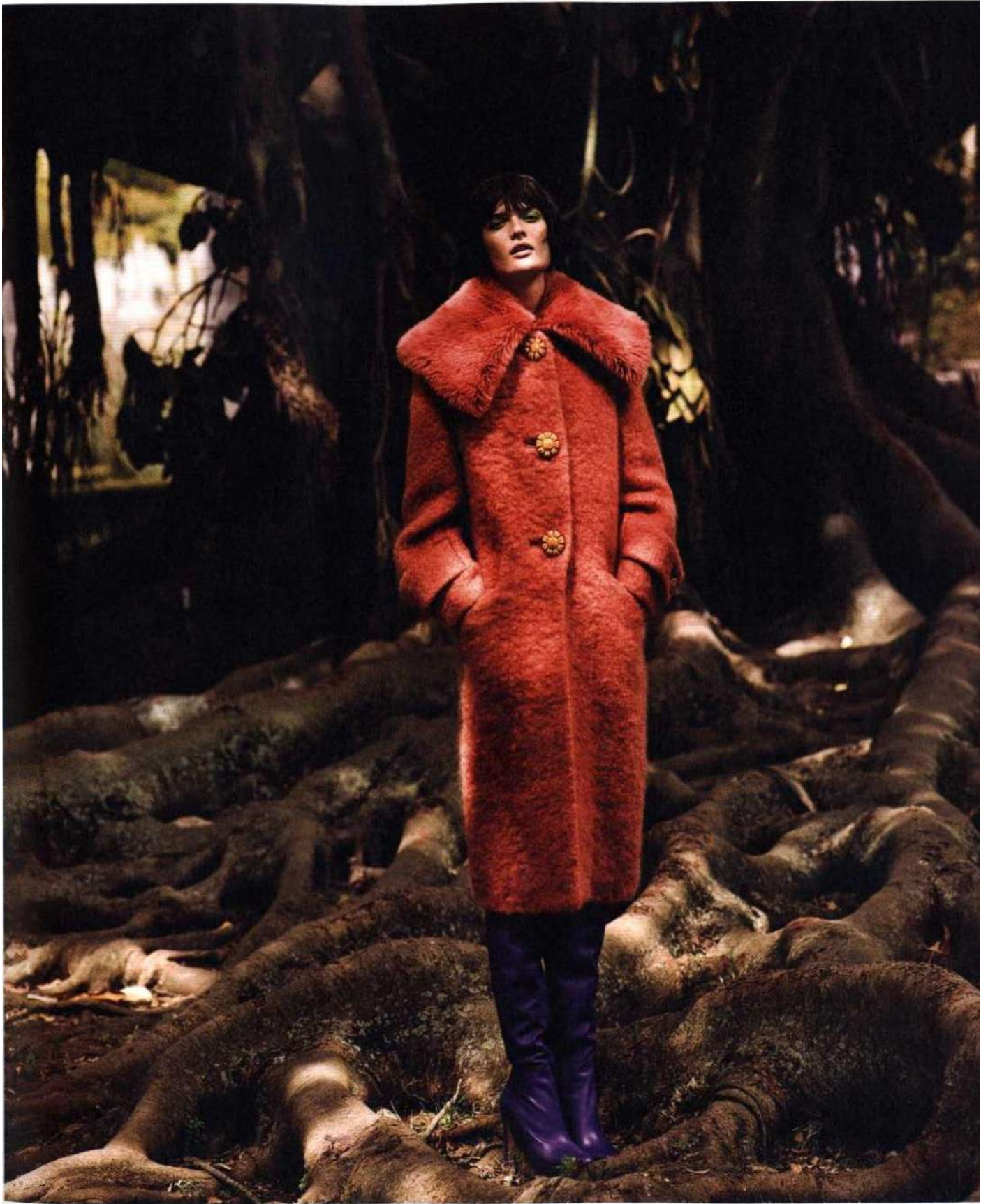
GERMANIA-HARPER'S BAZAAR-MIU MIU-AUGUST-2017