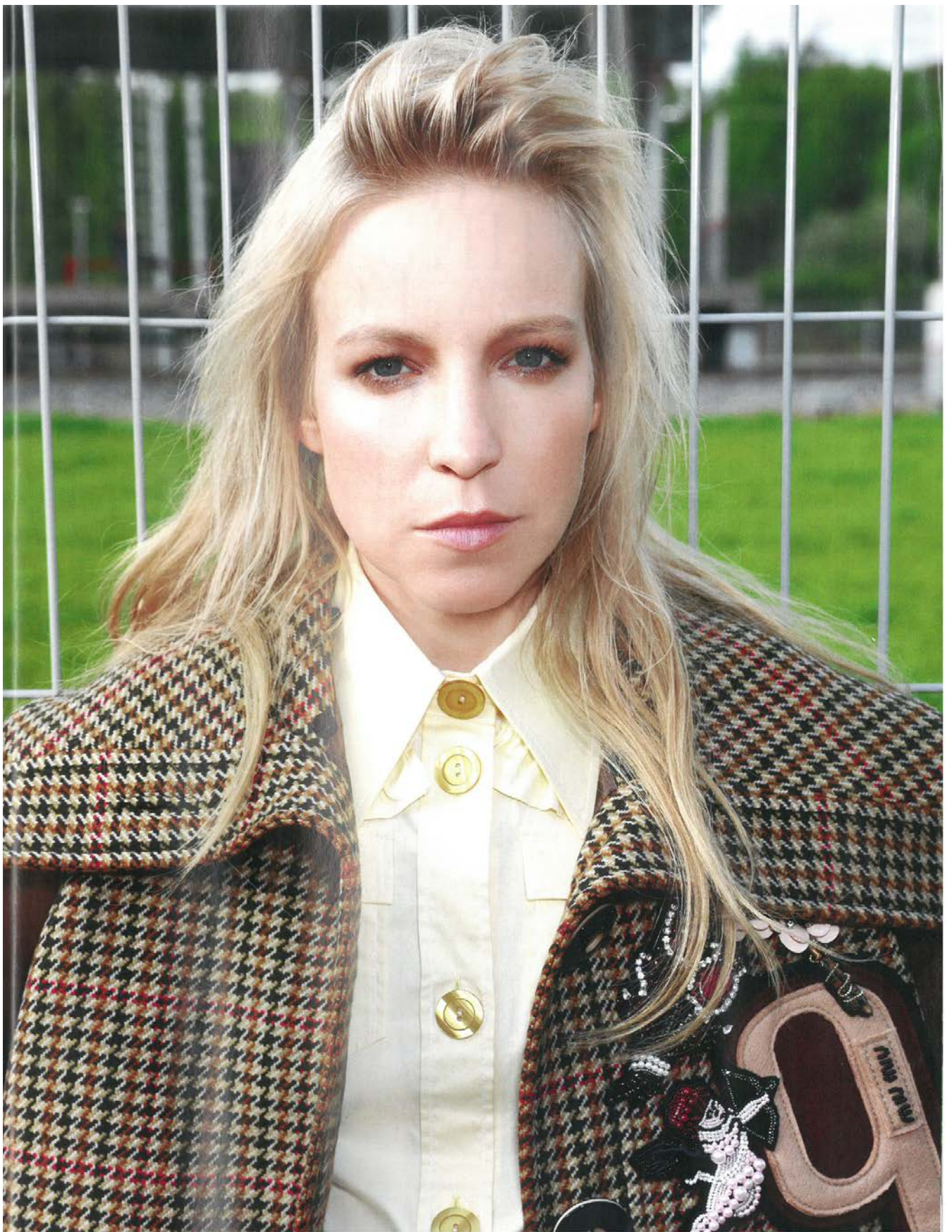
RUSSIA - HARPER'S BAZAAR - MIU MIU - 04.07.2017