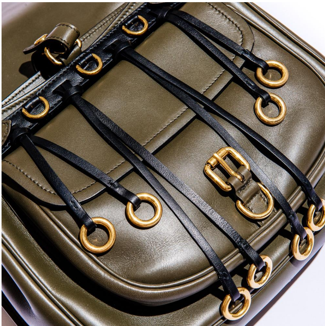
PRADA CORSAIRE BAG IN TERRACOTTA+BLACK & PRADA CORSAIRE BAG IN MILITARY GREEN