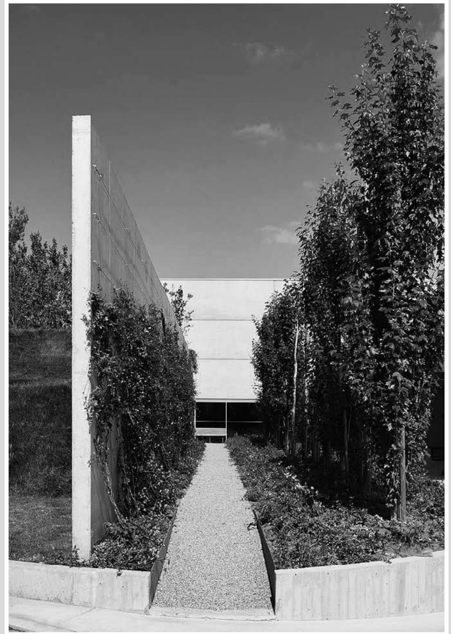
Nuovo Polo Logistico di Levanella